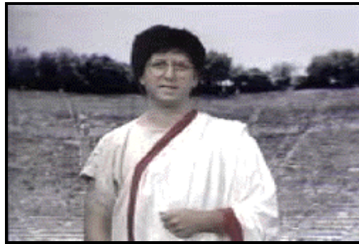
Scene from Graecia Capta

Verba notanda. Ut repetamus nuntios principales: Lucius Cornelius Sulla Athenas cepit! Multae partes urbis, inprimis agora et Erectheum in acropole, detrimenta acceperunt. Parthenon autem nil detrimenti accepit. Totum est ad hanc editionem Fori Romani . Gratias summas agimus et di vobis faveant. Valet omnes!