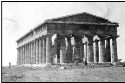
A Greek Temple in Paestum in Southern Italy (Magna Graecia)