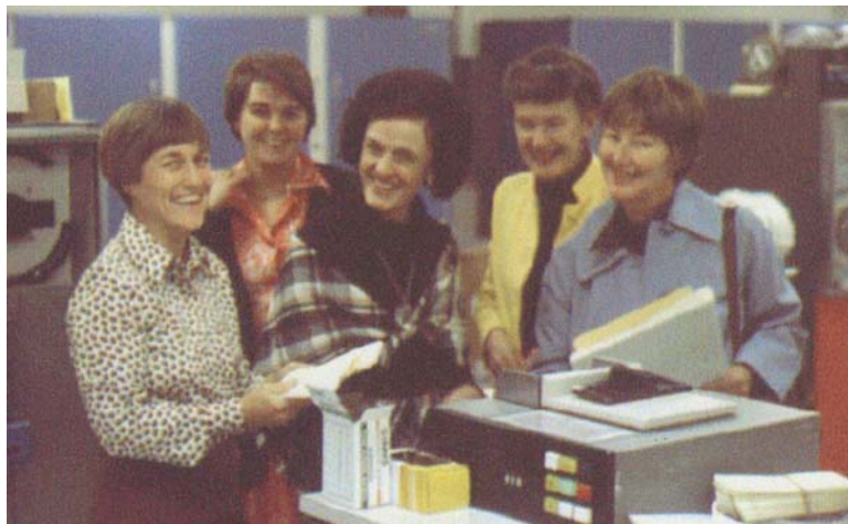
The founding mothers at Value Engineering in 1979

The committee accepted the bid of the Marine Corps Association in Quantico for the printing of the exams. The exams were typeset, and as the typesetter knew no Latin, proofing was a tremendous problem, and took many hours of close scrutiny. After many changes, 10,000 exams were printed.