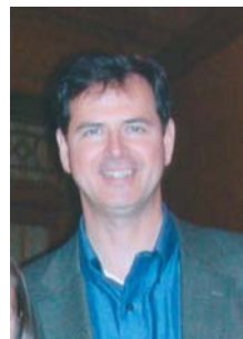
The real Favonius