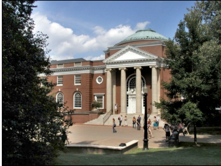
The University of Mary Washington's Trinkle Hall, home to the NLE